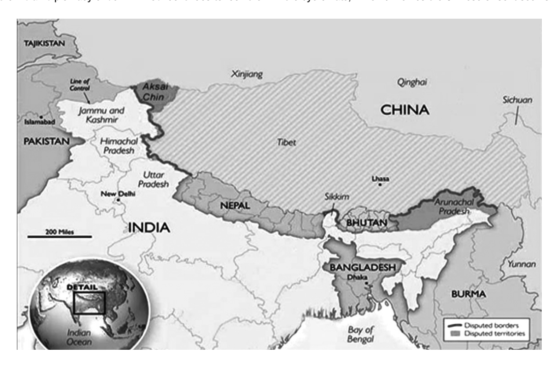
Notice Position And Importance Of Aksai Chin And Why Pakistan Wants to Make Northern Areas To A Fifth Province Thus support for Terrorism etc.